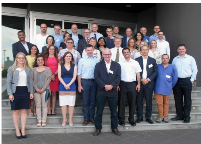
SENATOR team at the annual General Assembly meeting in Ancona—Sept 2015