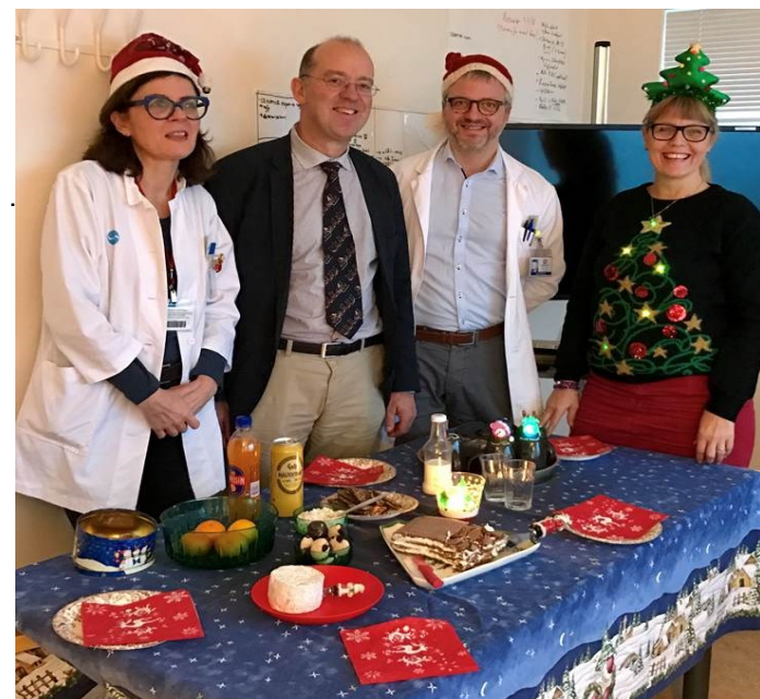
Seasons greetings from the team in Reykjavik